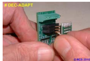
Carefully line up the pins on # DEC-ADAPT with the pins # 1 – 6 on # DEC-U .